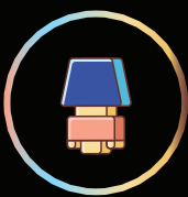
OUTEMU BLUE SWITCH CB-GK-27