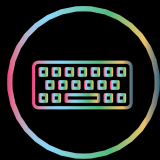
100 MILLION SWITCH LIFE