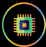
MCU FROM TAIWAN