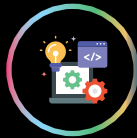
SOFTWARE SUPPORT FOR WINDOWS