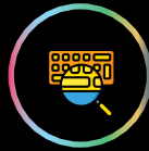
ALL KEY ANTI-GHOSTING