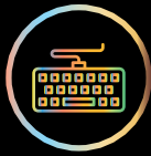
FULL SIZE KEYBOARD