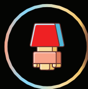
OUTEMU RED SWITCH CB-GK-26