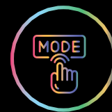
3 MODES WIFI+BLUETOOTH+WIRED