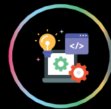
SOFTWARE SUPPORT FOR WINDOWS