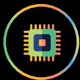
MCU FROM TAIWAN