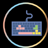
68 KEYS KEYBOARD