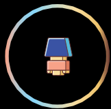
OUTEMU BLUE SWITCHES